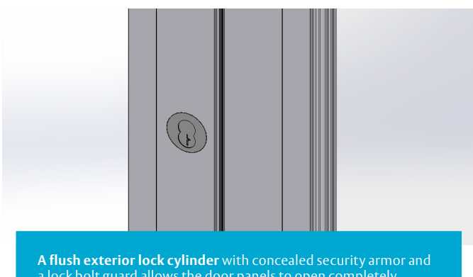
A flush exterior lock cylinder with concealed security armor and a lock bolt guard allows the door panels to open completely... simultaneously maximizing your space and protecting you from break-ins.

Compact space and expansive clear door opening isn't all you can expect from the ASSA ABLOY SL500 T67. With innovative, special enhancements, such as the exclusive "door on door" technology, the ASSA ABLOY SL500 T67 improves on inferior suspended track systems. Using two structural boxes instead of one, ASSA ABLOY eliminates misaligned doors that bounce and rattle, providing you with improved performance.