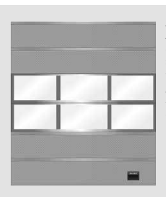
You can customize the OH1042S Configure track systems, select the color of the door, and choose the shape, number and placement of windows. There are literally thousands of options so you can tailor your door to your unique operation.