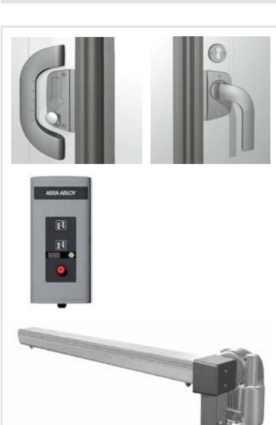
Options access and automation

Push button Pull rope Remote control Magnetic loops Photocells Radar