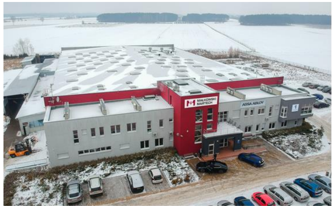
Figure 1 The view of MAŁKOWSKI – MARTECH S.A. manufacturing plant

“Małkowski-Martech” S.A. is a company with over twenty years of experience in the field of passive fire protection and is also an integral part of ASSA ABLOY, an international group specializing in the field of security. The manufacturing plant is located in Czołowo, Poland (Figure 1). This combination enables the creation of a comprehensive organisation that meets the highest standards of building security worldwide. The company delivers a wide range of certified products, including Marc-Ok fire protection curtain, horizontal sliding and overhead doors, smoke control curtains, theatre doors, special-purpose